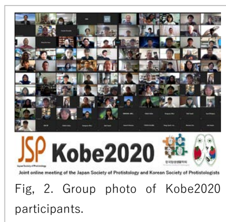
Fig. 2. Group photo of Kobe2020 participants.